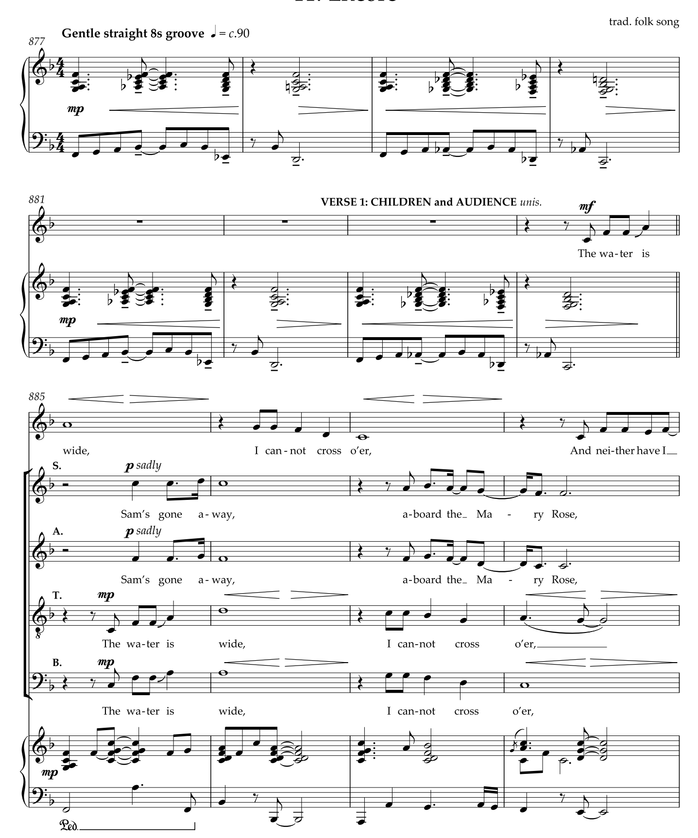
*This piece is always to be performed as the final number, but not to be listed in the concert programme: a 'surprise encore' for the audience, who should be encouraged to sing the melody with the children. It would be helpful to include the lyrics of The water is wide (verse 1) in your programme. They can be accessed on the Ahoy! website (ahoymaryrose.com).